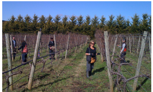
Our vineyard team creating the framework for Vintage 2013

In the vineyard there are elements over which we have no control, chief of these being the weather. Rather than this being a problem, it is really a cause for celebration as this is an aspect of terroir that makes the story of wine so exciting, individual and dynamic. If we were able to dictate the perfect season year in, year out, this would ultimately strip wine of any true character, rendering it just a drink, rather than something unique with a story to tell, to those who listen. Which is what we do. We listen, we watch and we learn. There is no escaping this mantra. Nature cannot be pleaded to or cajoled, leaving us as servants to our site and each unique season. This only serves to sharpen our focus onto the factors that we can control. This is occurring right now as we are currently pruning and therefore creating the platform for Vintage 2013. With pruning we can promote uniformity and overall balance, which provides for a healthy canopy and balanced fruit load for the year ahead.